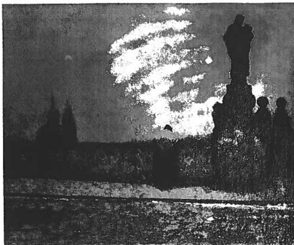
Nightfall at Hradčany (1909–1913), Jakub Schikaneder. Oil on canvas, 33.7" × 41.9", National Gallery, Prague, Czech Republic.