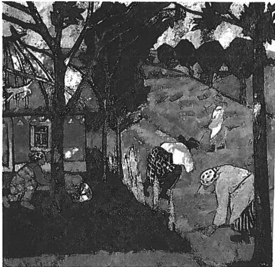
Grain Harvest (1908), Natalia Sergeevna Goncharova. Oil on canvas, 96 cm x 103 cm, The State Russian Museum, St. Petersburg, Russia.

Simon took yarn, put it round his thumb and began to twist it.